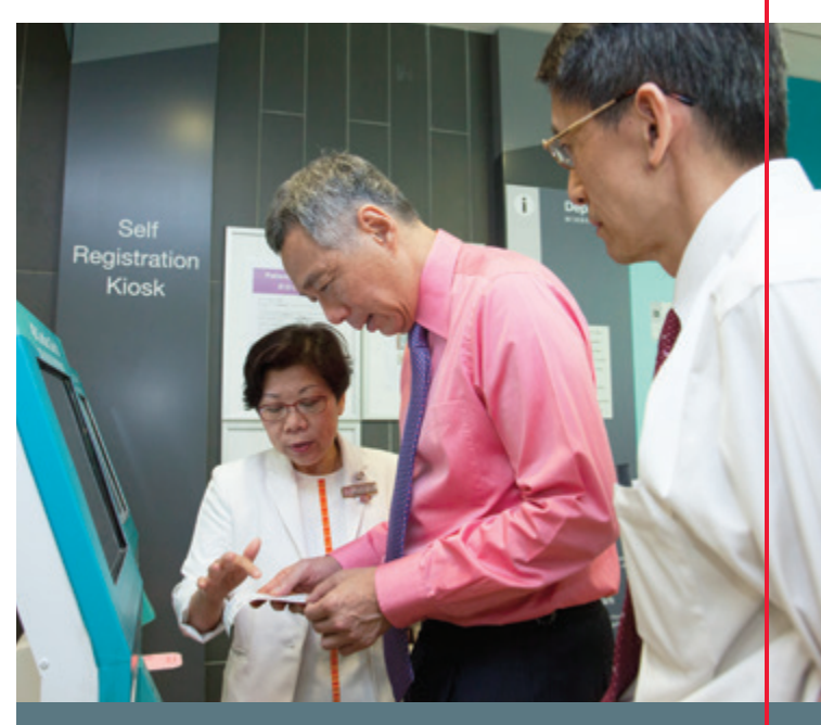
Prime Minister Lee tries out the 1 Queue 1 Bill system at NHCS.

are "important training grounds for generations of specialists and healthcare professionals, and trailblazers in researching and developing better treatments for patients". In line with the purpose of specialty centres, NHCS works closely with general practitioners to transfer heart patients in stable condition to the latter for regular follow-ups, a process known as right-siting. More than 60 per cent of patients at NHCS were successfully right-sited in 2014, and this is double the proportion the year before.