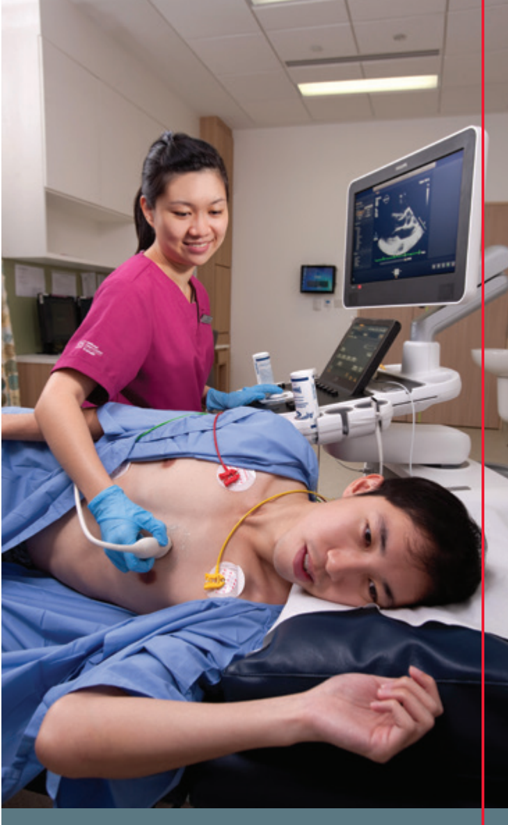
Standard echocardiography machines are able to produce higher resolution ultrasound scans.

So what are some of the clinical settings where PHHE might be useful? Presently, it seems that they are best used for quick, focused assessments of cardiac and non-cardiac structure and function, and they can possibly be used as an integrated part of the physical examination. This has been shown in intensive care units and surgical and cardiac departments to lead to better selection of patients for further medical imaging or invasive tests, or guide subsequent therapy or interventions. Usage in outpatient clinics or even in primary care can be further potential settings, though it is recognised that user competency and skill are still highly important. Both the European and the American Associations of Echocardiography agree that a certain level of competence and skill of the user is required. However, how this should be assessed or determined remains unresolved, as is the optimal level of training required.